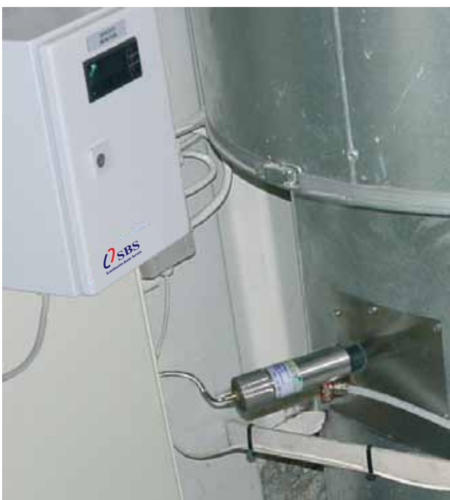
An installation of a G1000 Smoke Density Monitor with the monitoring unit and one optic head

Port authorities and regional authorities around the world – but especially in North America – are to increasing degrees regulating emissions from ships as well as from industrial plants. Although legislation is varying, regulations in North America would typically rule that ships may not emit smoke with an opacity of more than 20% for more than 3 minutes. A similar limit is set for shipboard incinerators by IMO.