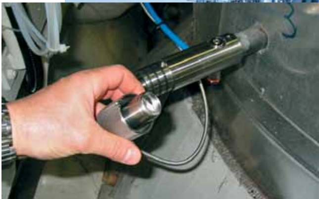
Easy lens cleaning