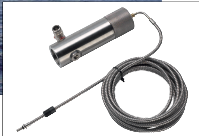
Optic head with fiber-optic cable

The SBS 1000 Smoke Density Monitor is a particular robust system that is well suited to resist heat and vibrations in and around smoke stacks. Our patented technology removes the light source from the smoke stack contrary to competing technology. Instead, the infrared LED is placed in the monitor cabinet and the light beam brought to the smoke stack via robust optic fibers. The lenses of the optic heads are kept clean with purge air.